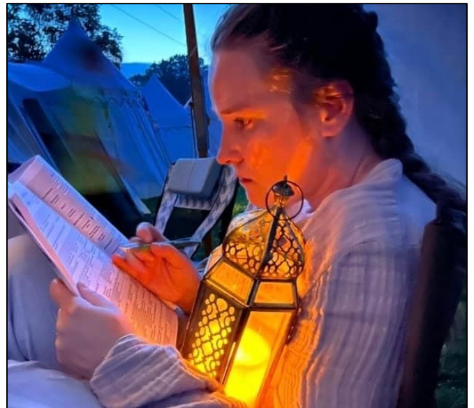
Pictured above: Lady Dagný reads by the light of a lantern at Pennsic 50. Wishing light to the populace of Bright Hills!