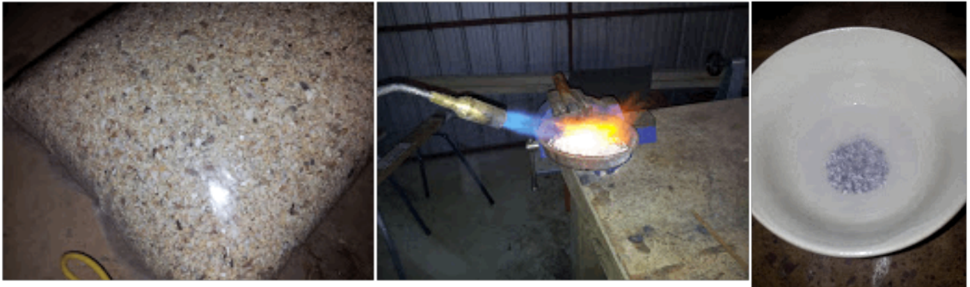
Shell grit - heating shell grit with the gas torch - quicklime!

We heated the shells red hot for about 5 minutes using a gas torch. This seems to have worked, creating a small amount of quicklime.