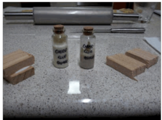
Bits of wood stuck together - samples for display/final entry