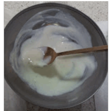
Making the lime water - asiago mix - quark mix