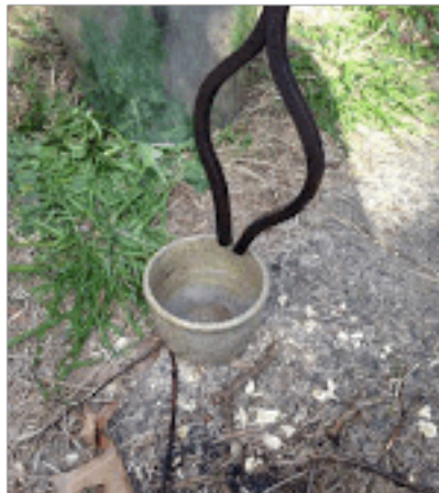
Crucibles heating up - testing for quicklime