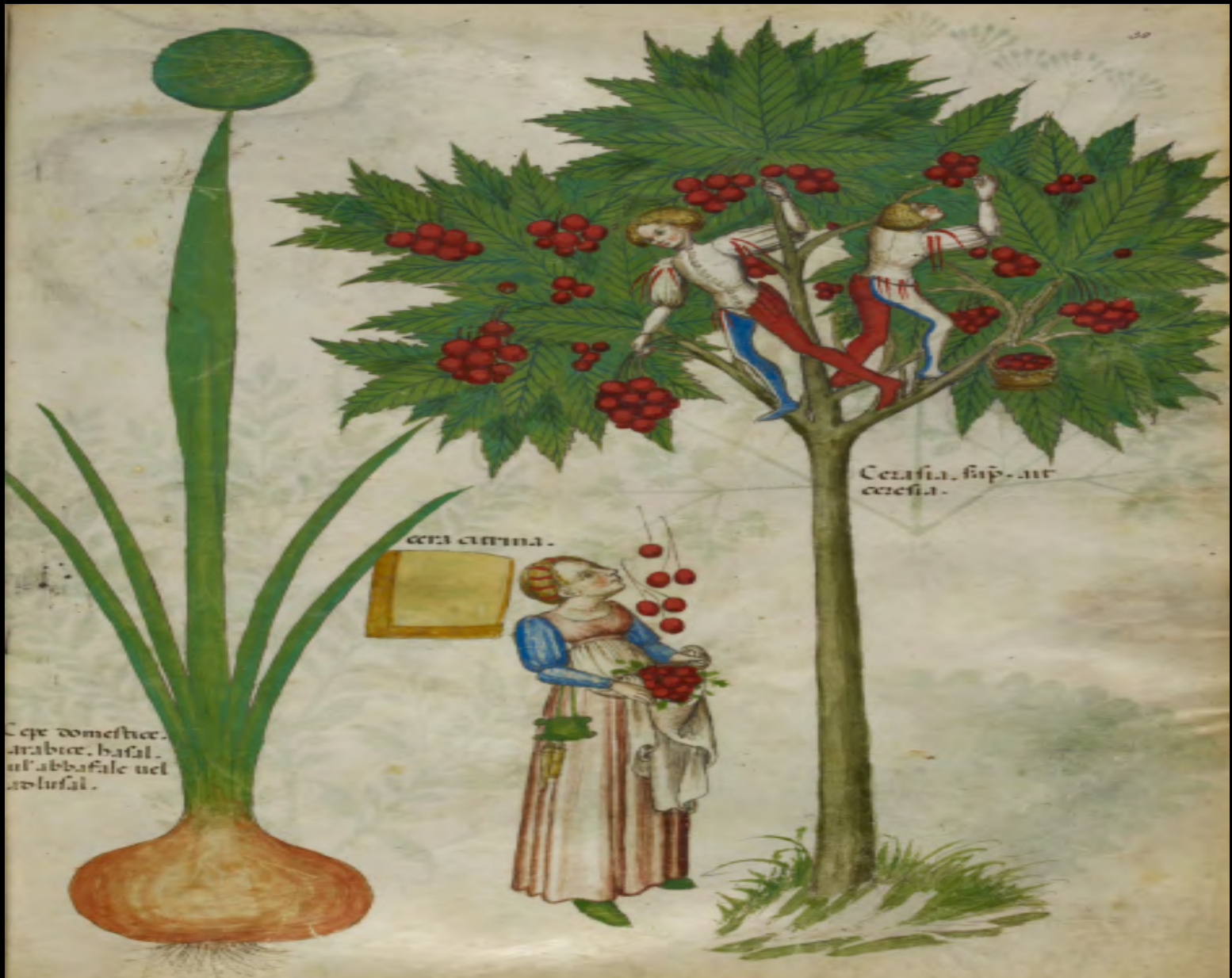
The cherry harvest, with boys standing in the branches of the tree and throwing cherries down to a woman below, Sloane MS 4016, f. 30r

The official Newsletter of the Barony of Bright Hills