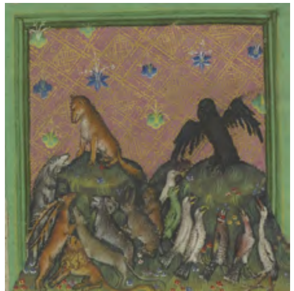
image to the right: The Fox and Raven are chosen as the wisest animals: Egerton MS 1121, f. 4v

When the animals gather to choose the wisest, they divide into two factions. The land animals nominate the Fox and the birds elect the Raven. But the Monkey intervenes, explaining that they have chosen not with reason but with carelessness and poor judgement. They have allowed themselves to be misled, mistaking the cunning of the Fox and Raven for wisdom.