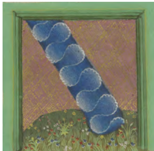
image to right: The new-born Cloud leaps up from the Earth: Egerton MS 1121, f. 58v

Question things that appear to be certain.