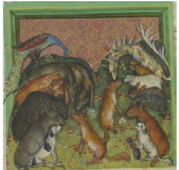
image to the right: The Pilgrim Fox chooses his company: Egerton MS 1121, f. 36r

The Fox has remorse for his sins and decides to go on a pilgrimage. En route, the Dog, Donkey, Bear, Lion, Wolf, Swine and Peacock try to join him, but the Fox considers them imprudent and shakes them off. Instead, he chooses wiser animals as his fellow pilgrims: the Ant, Tracking Dog, Ox, Hedgehog, Hare, Lamb, Monkey and (multi-coloured) Panther. The Fox explains that, if you keep company with the wise and holy, you will become wise and holy as well.