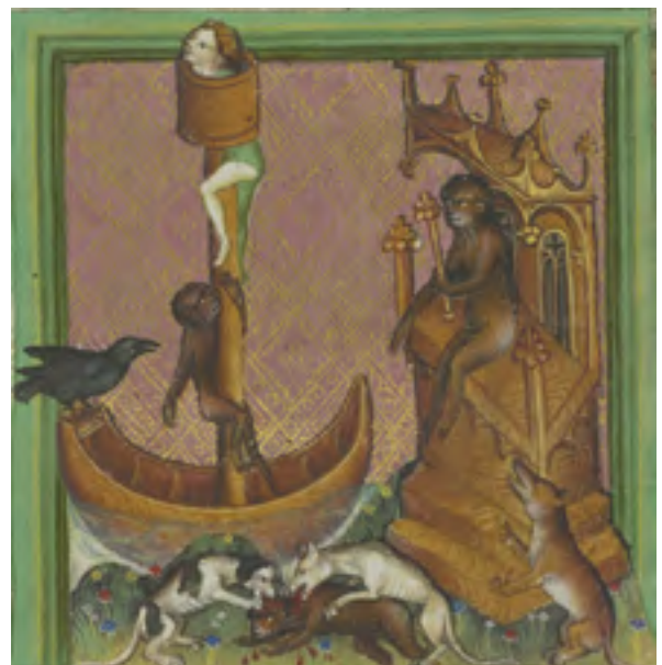
image to the right: The Monkey ignores the advice of the Raven and the Fox: Egerton MS 1121, f. 48v

from Medieval Manuscripts blog 18 May 2020 of the British Library