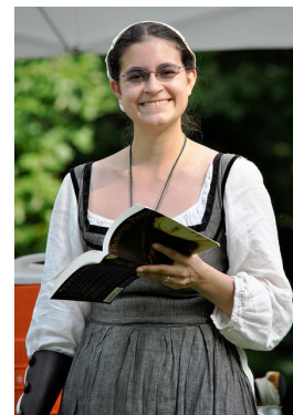
The Bright Hills bards entertain the populace.