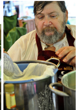
Lord Sfi, Lady Scholastica & Mistress Cordelia compete in Trial By Fire. Master Chirhart makes cheese.