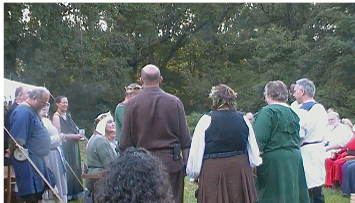
The newcomers are called into court.