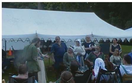
Lady Nem and Mistress Cordelia win the cheese competition.