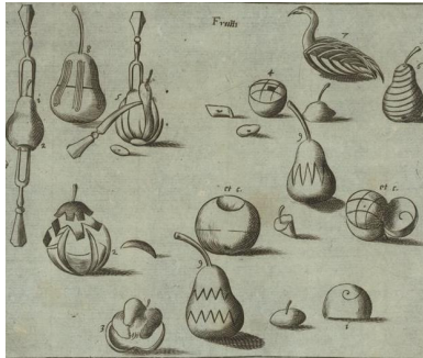
Plate 21 from Li tre trattati .

Li tre trattati di messer Mattia Giegher bavaro di Mosburc, trinciante nell'ill.ma natione alemanna in Padoua first published in 1639 in Padua Italy has a section on frutti and engravings showing fruit being carved into various decorative shapes, including the well known swan. In Li tre trattati , the swan is made from a pear, not an apple. Italian carving manual by Giegher, Mattia includes engravings that feature "frutti". While I cannot read the Italian manuscript, the engravings are very instructive.