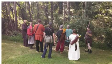
Archers compete for the Lochmere Arrow.