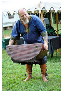
Lord Randver holds the toy chest.

We will be located in the circle in front of the church, which makes unloading much easier. Then we have to move our cars across the road to the park.