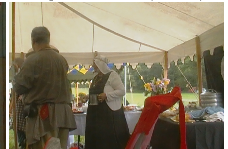
The barony enjoys a "light" lunch.