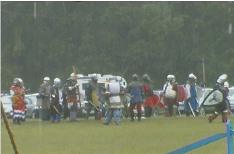
Fighters battle rain and each other at Battle on the Bay.