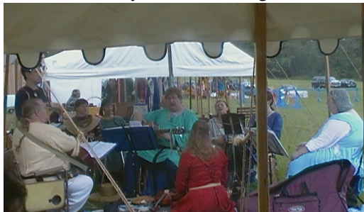
PAGE entertains the populace.