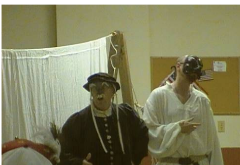
Iron Comedia perform at KASF