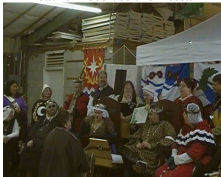
Godai is given an Opal