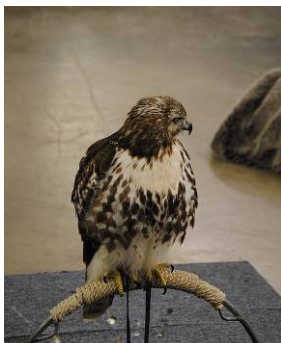
A special visitor at KASF