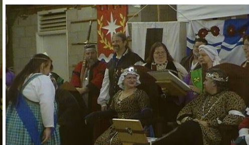
Scholastica is made a Lady