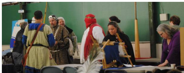
Viewing the A&S Displays