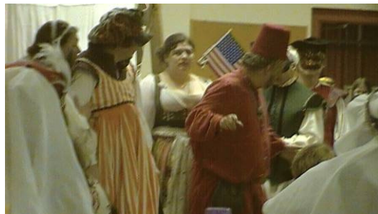
Iron Comedia perform at KASF