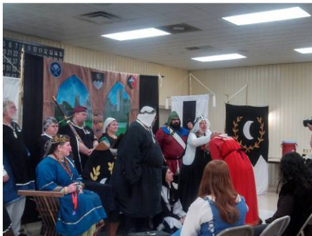
Poline receives a Tessa