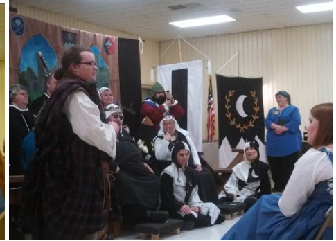
Faolán wins the Bardic Bearpit