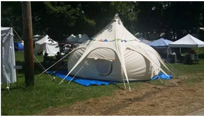
The tent of Lady Reyne.