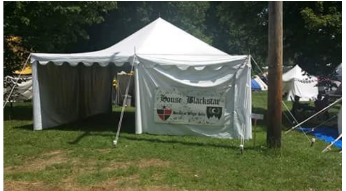
The camp of House Blackstar